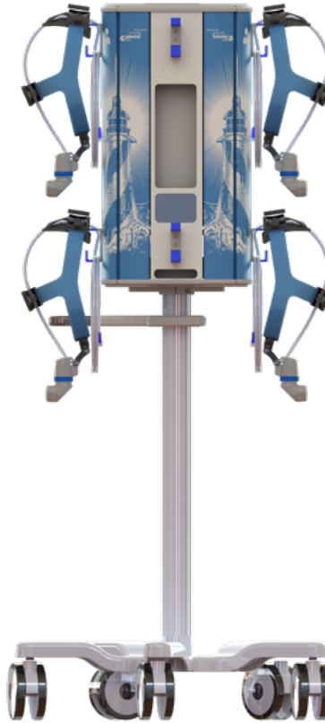
BAYPORT STORAGE SOLUTION WITH FOUR MODULES SHOWN WITH THE MOBILE STAND KIT —BFW 5440 W2 + BFW 5440 MS— (HEADLIGHTS SOLD SEPARATELY)