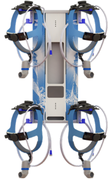
BAYPORT STORAGE SOLUTION SHOWN WITH WALL MOUNT RAIL KIT. CONFIGURED WITH THE TOP AND BOTTOM DUAL HANGER KITS —BFW 5440 W2 + BFW 5440 MR— —BFW 5440 TDK + BFW 5440 BDK— (HEADLIGHTS SOLD SEPARATELY)