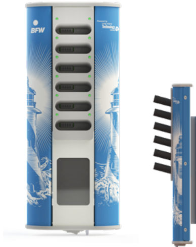
BAYPORT 6-BAY BATTERY CHARGING SOLUTION SHOWN WITH WALL MOUNT RAIL KIT —BFW 9020 BC6 + BFW 5440 MR— (BATTERIES SOLD SEPARATELY)