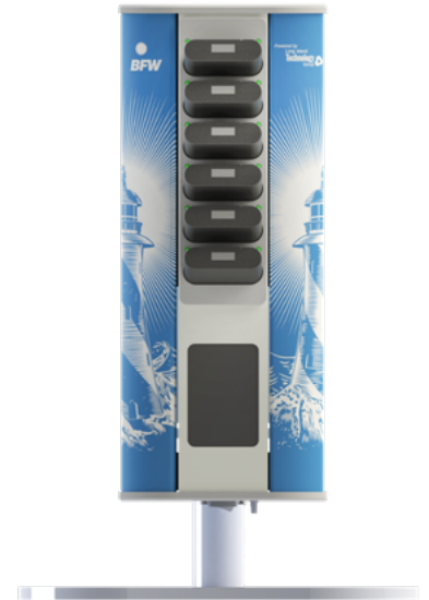
BAYPORT 6-BAY CHARGING SOLUTION SHOWN WITH THE TABLE STAND KIT —BFW 9020 BC6 + BFW 5440 TS— (BATTERIES SOLD SEPARATELY)