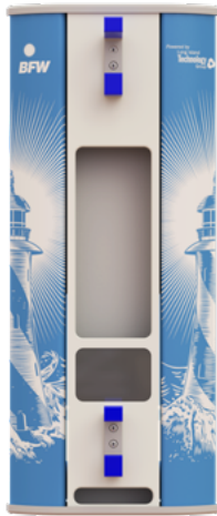
BAYPORT HEADLIGHT STORAGE SOLUTION SHOWN WITH WALL MOUNT RAIL KIT —BFW 5440 W2 + BFW 5440 MR— (HEADLIGHTS SOLD SEPARATELY)